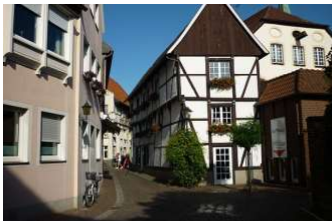
“Kanonenburg” in the old town