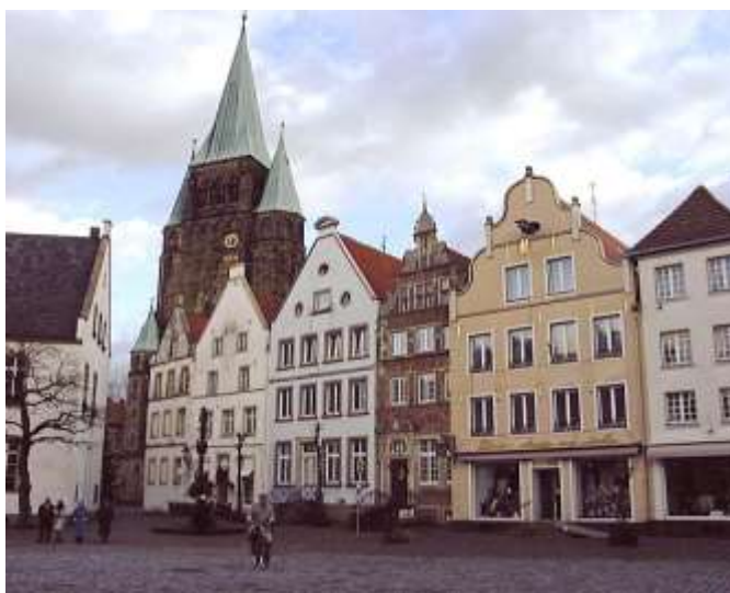
Market square with “Laurentiuskirche”

Warendorf is located in North Rhine-Westphalia, 30 kilometres eastern of Münster and 160 kilometres north-eastern of Düsseldorf. The City of Warendorf, often described as the “City of Horses”, has been founded around the year 1200 and is home for about 37,000 residents.