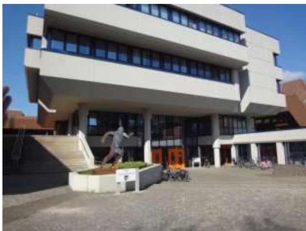
Entrance to the Competition and Training Venue (accessible on ground level)

Training will be carried out on three Training Courts (Court C, Court D and Court E), all of them are located in the same sports hall next to the Competition Venue.