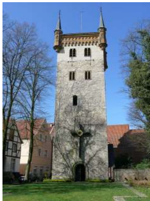
Gothic tower of „Marienkirche“